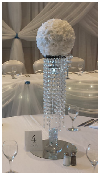
Crystal Centrepieces - $15.00 each

They can not be returned with wax in or on them or there is a $40.00 cleaning fee per vase.